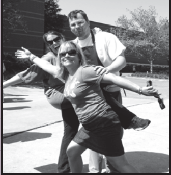
Cobb Bar Association Law Day Activities