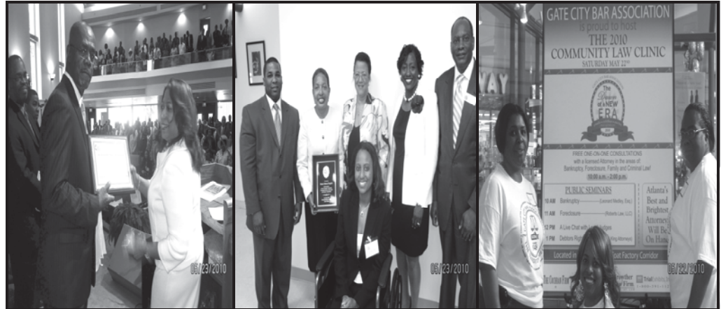
Law Day Activities across Georgia

Guantanamo.” Materials to support Law Day activities are placed on the State Bar website every year by the Committee on Professionalism and are also available from the American Bar Association at www.lawday.org including a map listing Law Day activities around Georgia.