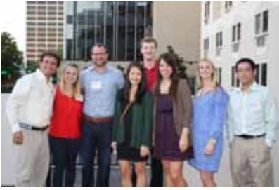
Law School Fellows from John Marshall, Emory and Mercer attend the YLD Fall Meeting in Chattanooga.