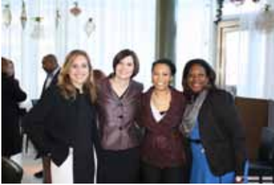
Alumni and new participants of the Leadership Academy attend a holiday luncheon.