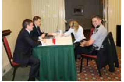
Young lawyer volunteers assist first responders in preparing wills at an event in Augusta on Dec. 14.