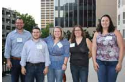
Members of the Dalton/Conasauga area attend the YLD Fall Meeting in Chattanooga.