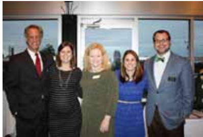
YLD Family Law Committee Chairs, staff from AVLF and the YLD President at the committee's Supreme Cork.