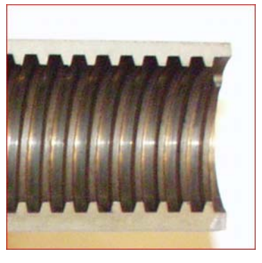
Normal Acme Nut

All of this came about due to a very simple cause: a lack of lubrication of the jackscrew assembly. As noted above, the jackscrew was found without any grease on its operating surfaces, and