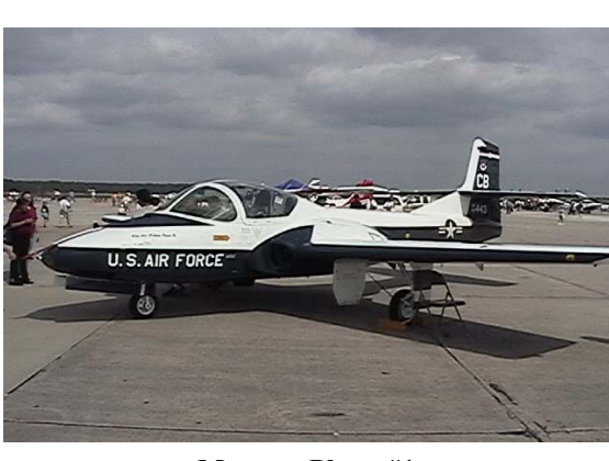
Mystery Plane #1

("NOPCA") from the FAA. We moved to dismiss the case as stale, since the alleged violation took place more than six (6) months prior to the issuance of the NOPCA. Of interest was the fact that the FAA was on notice of the infraction in May of 1997, when it received a computer tape from the