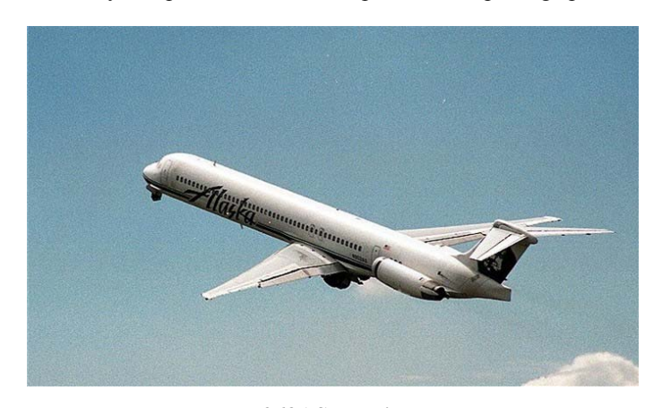
N963AS In Flight

regardless of the flow issues. When the autopilot was disengaged again at 1609:20, the aircraft began a steep dive, reaching speeds of 353 KIAS until the aircraft stabilized at 24000 at 1610:33. Even after the aircraft stabilized, 120 pounds of pulling pressure