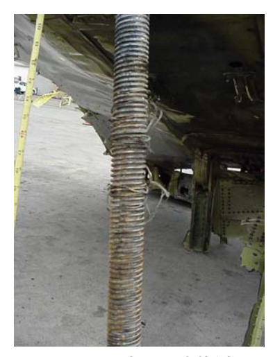
Jackscrew from N963AS, Recovered without any Grease on the Operating Surfaces and with Remnants of Screw Shavings Still Attached

with sandy, metallic grease located at each end. It doesn't take an accident investigator to figure out that a lack of grease on the jack screw assembly would subject the assembly to excessive wear and catastrophic failure. So how did this happen?