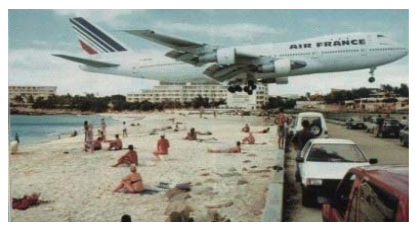
Captain: "Isn't that red over red on the VASI?" First Officer (flying): "Actually, that's a black over white zebra print."