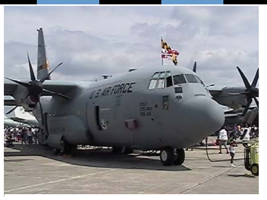
Mystery Plane #2