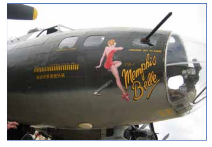
continued on page 12

In the midst of this on-stage performance, an airshow was unfolding. DeKalb Peachtree Airport was shut down for the big event. The B-17 named "Memphis Belle" was starting up and being piloted