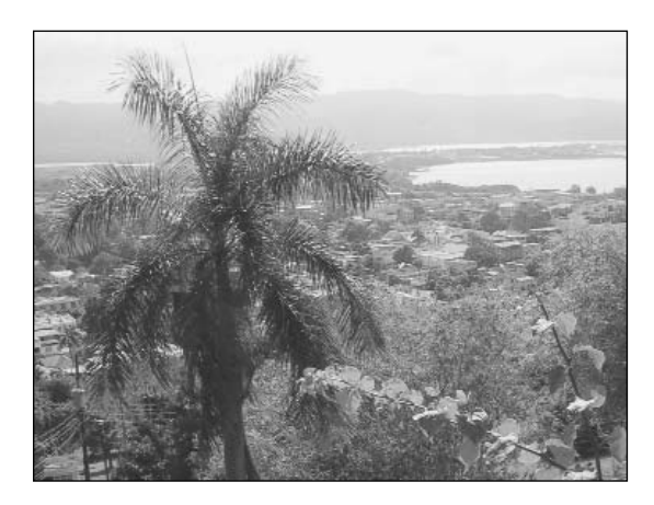
A mountain view of the city of Montego Bay, Jamaica, including the Caribbean Sea in the distance.