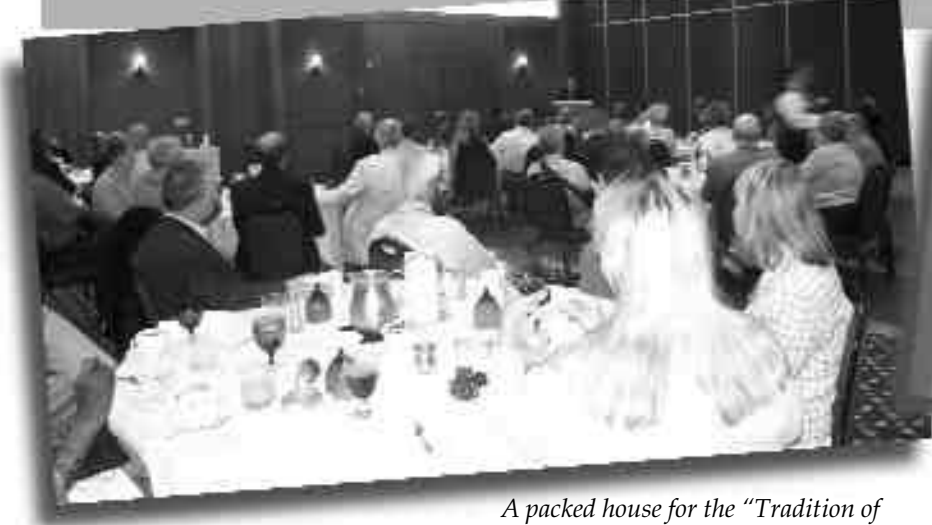
Excellence Award" breakfast.

June 12-14, 2003 • Amelia Island, Florida