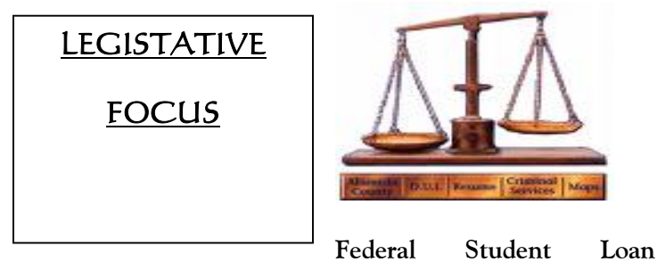
Forgiveness for Prosecutors and Public Defenders

Amicalola Falls was beautiful and many attendees stayed Sunday night. We invite you to attend the seminar next fall at Red Top Mountain.