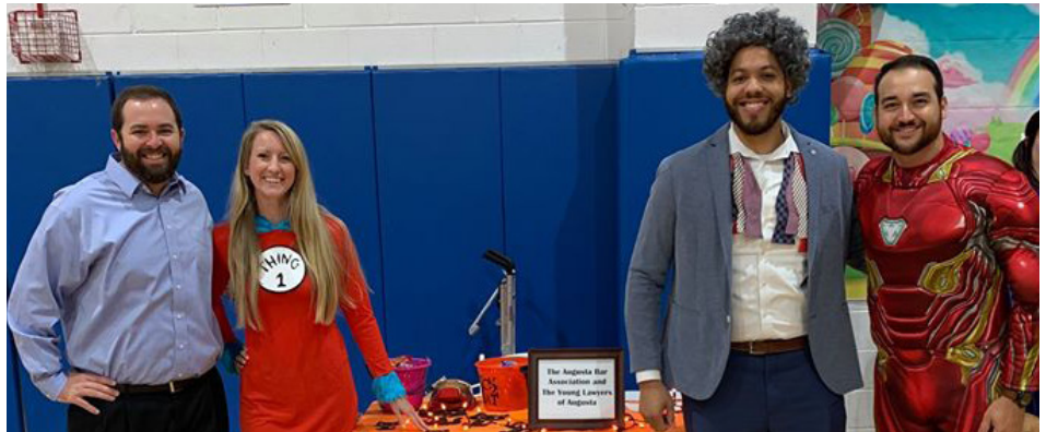
Members of the Young Lawyers of Augusta volunteered at Halloween with a Heart where children with special needs could trick or treat in a safe and supportive environment.