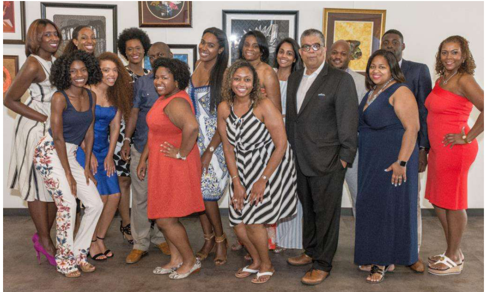
Attendees of the Gate City Bar's YLD Brunchin' With a Cause event pose for a group picture.