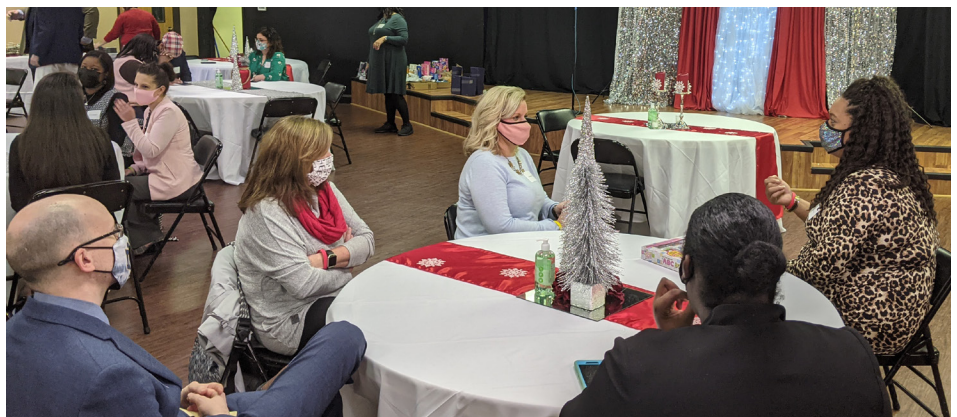
Holiday partygoers stay masked up prior to dinner.