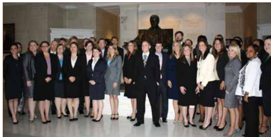
Forty-four members of the Young Lawyers Division were sworn in to the U.S. Supreme Court during the YLD Spring Meeting.

Whether by foot or atop a bus, YLD members spent Saturday afternoon sightseeing. The Lincoln and Jefferson Memorials, the World War II, Vietnam and Korean War Memorials, Union Station, Ford's Theatre, the Smithsonian museums and government buildings were all seen by members of the YLD before they