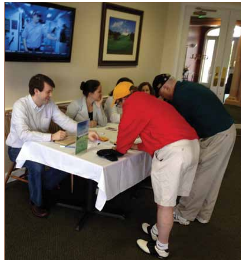
Members of the Cobb YLD take registrations and sell raffle tickets for the Cobb County Bar Association's inaugural Law Day Classic Golf Tournament.

Since its inception, the Fund has provided more than $200,000 in financial assistance, and last year alone it provided assistance to approximately 100 families. The money raised at the Law Day Classic will go a long way to helping Cobb families who are facing a financial crisis. The Cobb YLD is pleased to have supported such a deserving cause for its Great Day of Service.