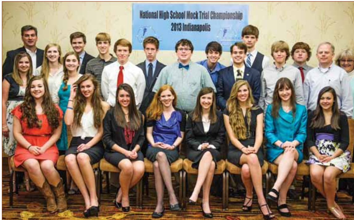
Middle Georgia Christian Home School Association's mock trial team at the national championship in Indianapolis, Ind.