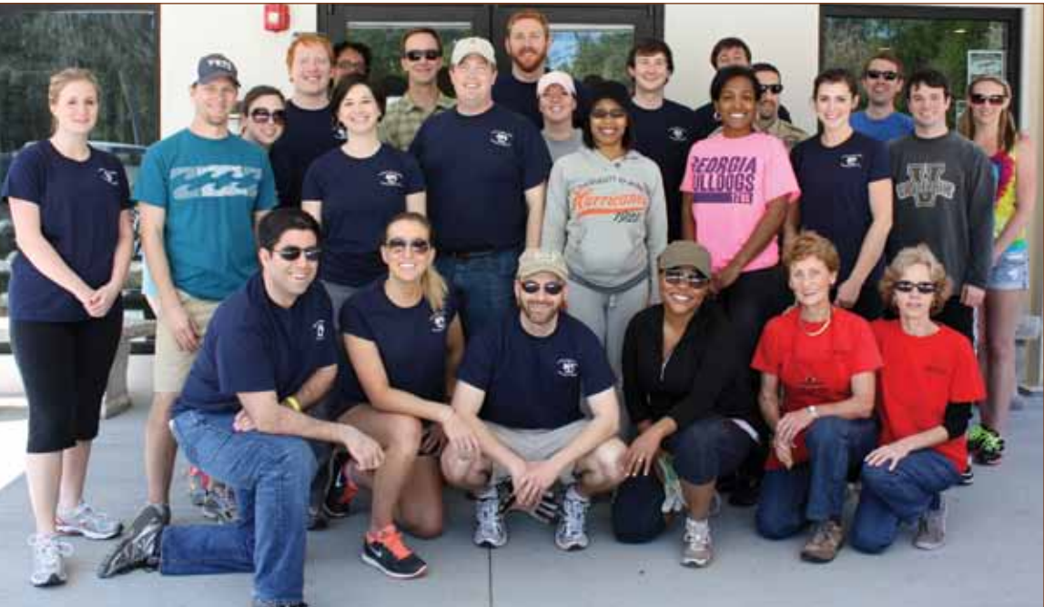
YLD members and Leadership Academy participants volunteer at the Humane Society of South Coastal Georgia for the Spring Meeting.