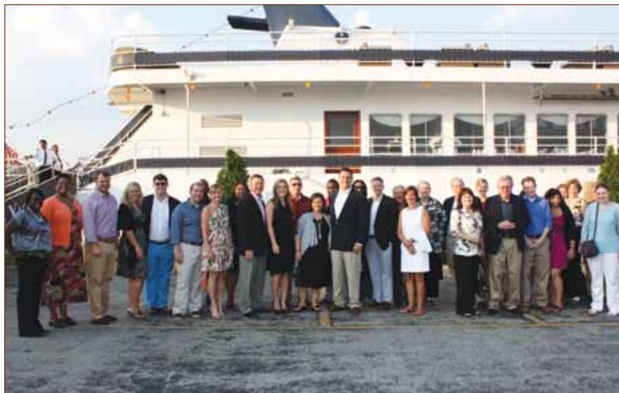
YLD and Board of Governors Members prepare to board the World Yacht — Duchess to cruise around the tip of lower Manhattan.