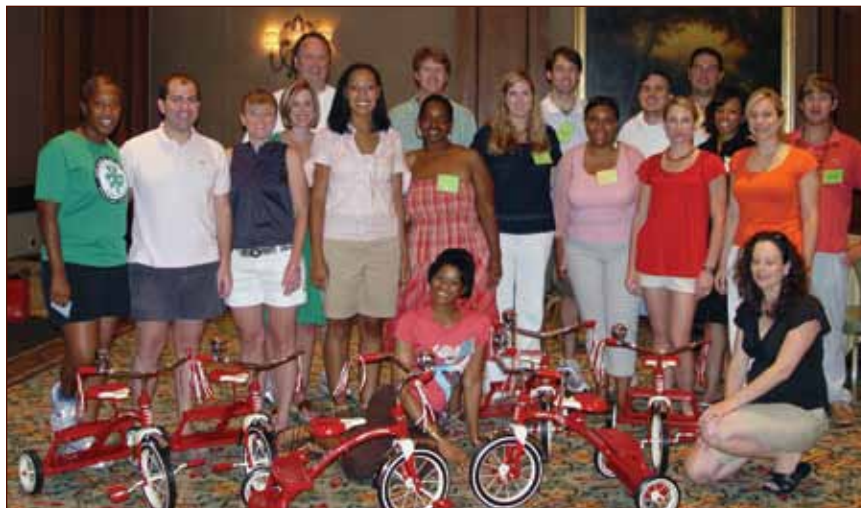
YLD Executive Committee members assembled tricycles, which were donated to the Greene County Department of Family and Children Services for distribution to local children at their Long Range Planning Retreat.