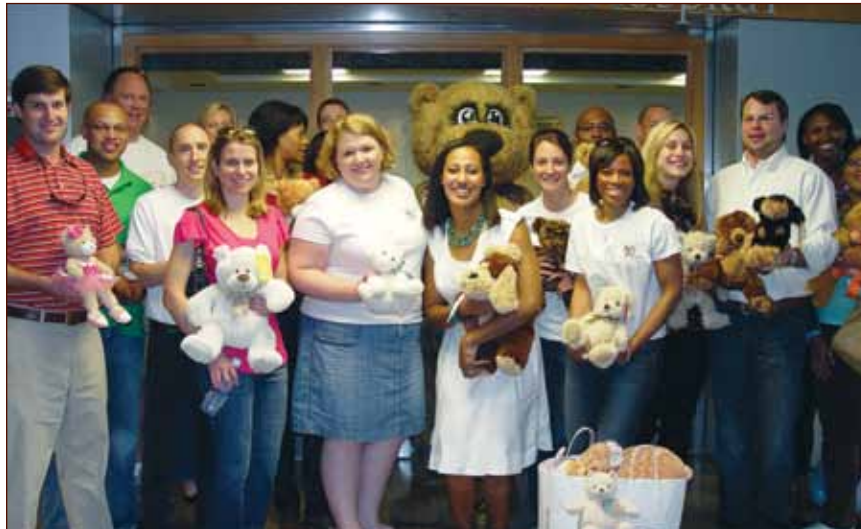
YLD members deliver more than 100 teddy bears to children at Asheville's Mission Children's Hospital as part of the Summer Meeting Service Project.