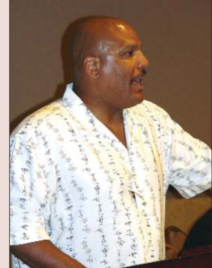
Judge Gino Brogdon