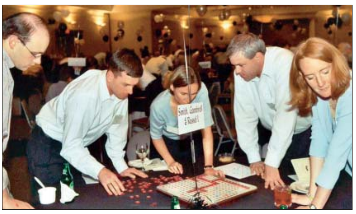
(Above) Members of one of Smith, Gambrell & Russell's 2003 scrabble teams. (Right) Members of one of Kilpatrick Stockton's 2003 scrabble teams.