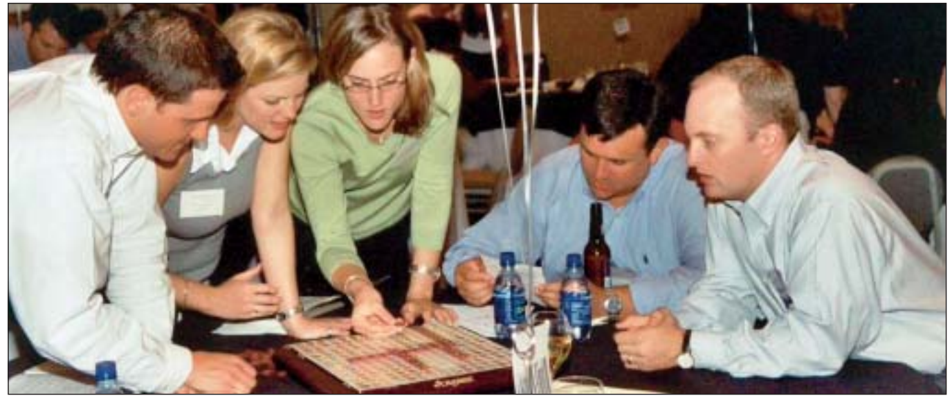
Members of one of Alston & Bird's 2003 scrabble teams.

Each team of five will compete in two rounds of speed Scrabble with a brief break between each