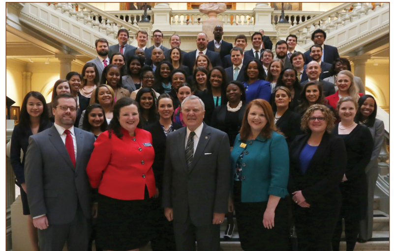
2015 Leadership Academy participants with Gov. Nathan Deal (front row, center) at the Georgia Capital on Feb. 24.

The fifth session of the Leadership Academy took place in Savannah in May and focused on pro bono and community service. The class enjoyed a stroll through downtown Savannah and a tour of the historic Federal